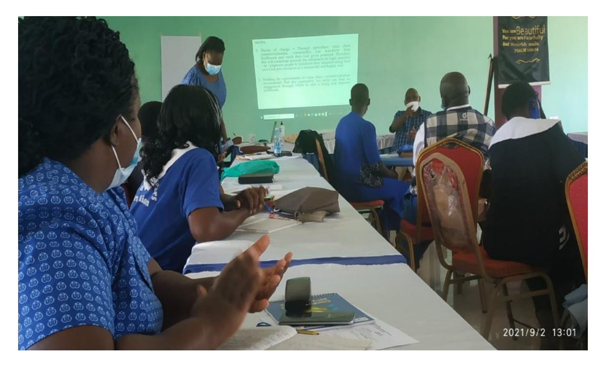
Fig. 4 EAGLE PROCES TEAM meeting at Mumias