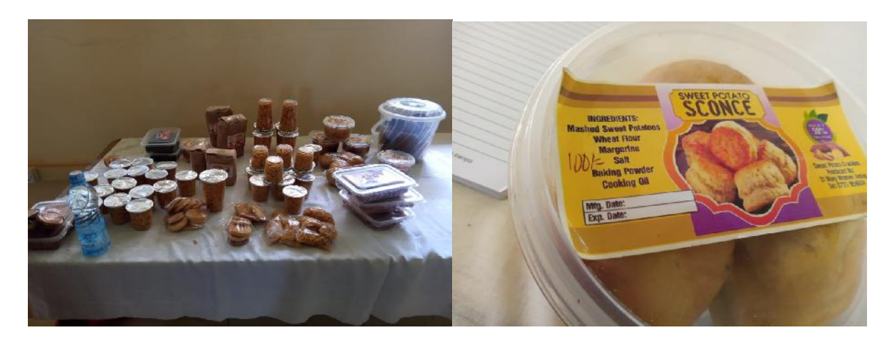
Fig. 5 Sweet Potatoes Value addition.