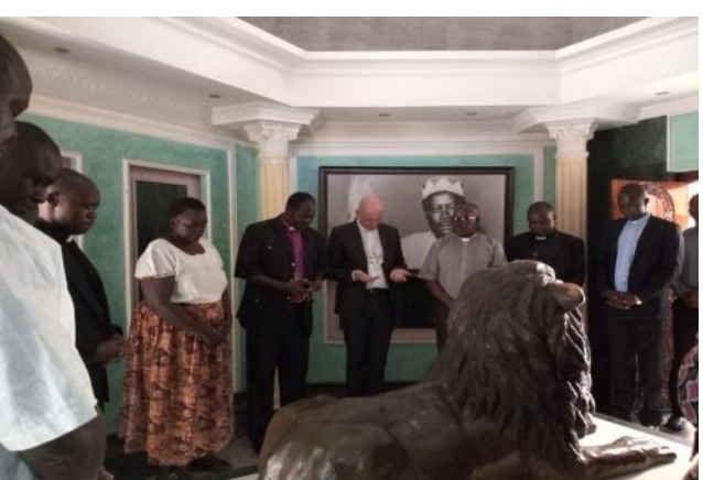
Anglican Diocese of Bondo P.O Box 240 – 40601, BONDO