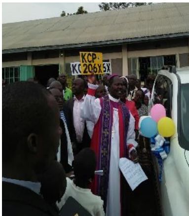
Bishop showing the car registration number