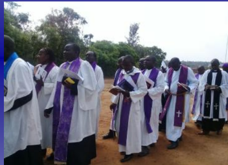
Procession for the Mothering Sunday Service.