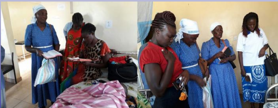
Our recent pastoral visit to the sick at Bondo District Hospital

Mothers' Union is a global Christian Organization with 4 million-strong membership living in over 83 countries who believe in importance of families. Through fellowship, programmes and prayer, Mothers Union members change lives and bring Christ's hope to the lowly. Our aim is to demonstrate the Christian faith in action by the transformation and empowerment of women. Part of our major programmes include: visiting and praying with the sick, fellowship with bereaved families and above all setting up high standards of family values. Bondo Diocese we has 51 parishes, 8 Deaneries and 4 Archdeaonries. We have so far managed to commission members in various congregations, with continuous training programmes at the Archdeaconry level. This will enable us to reach out the larger congregations in the parishes.