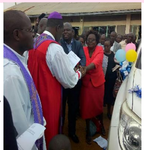
Mobilization Committee's Chairpersons handing over the Car keys to the Bishop