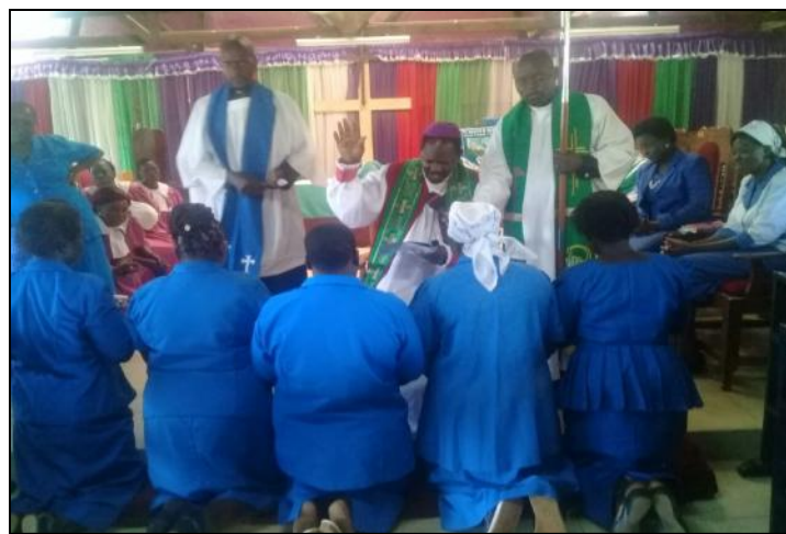
Commissioning of new members