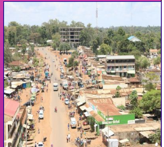
Ariel view of Synod Plaza