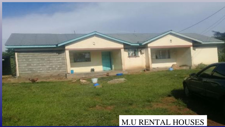
M.U RENTAL HOUSES